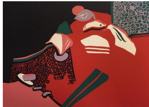
Vegetation by Liz Conces Spencer