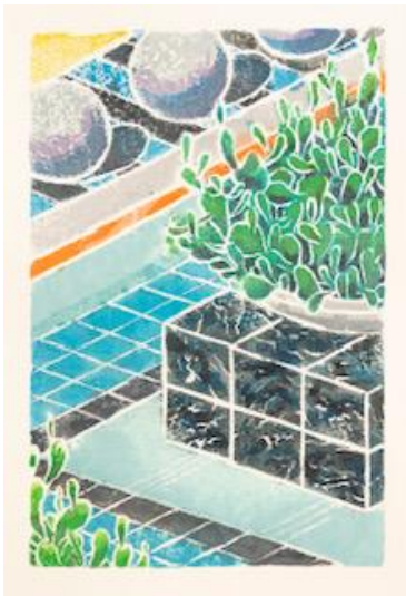
Future Garden II by Alexander Squier