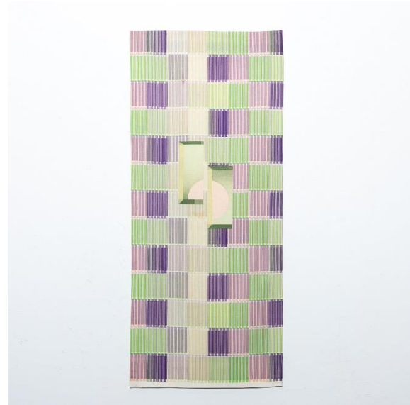
Untitled (portals) by Molly Koehn